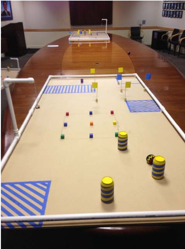
The Official Boards