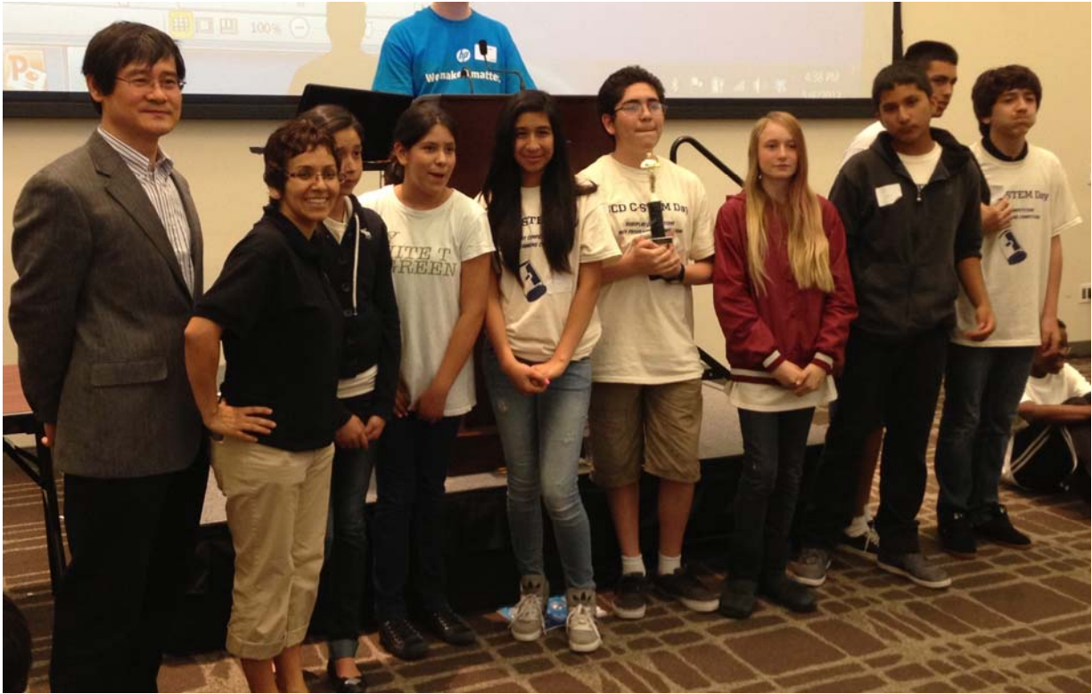
Winner for Best Overall Roboplay Video