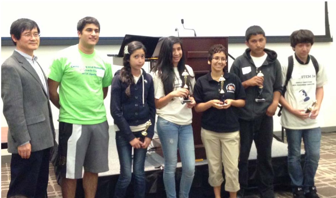
1 st Place Middle School: RoboPlay Challenge Competition Winners